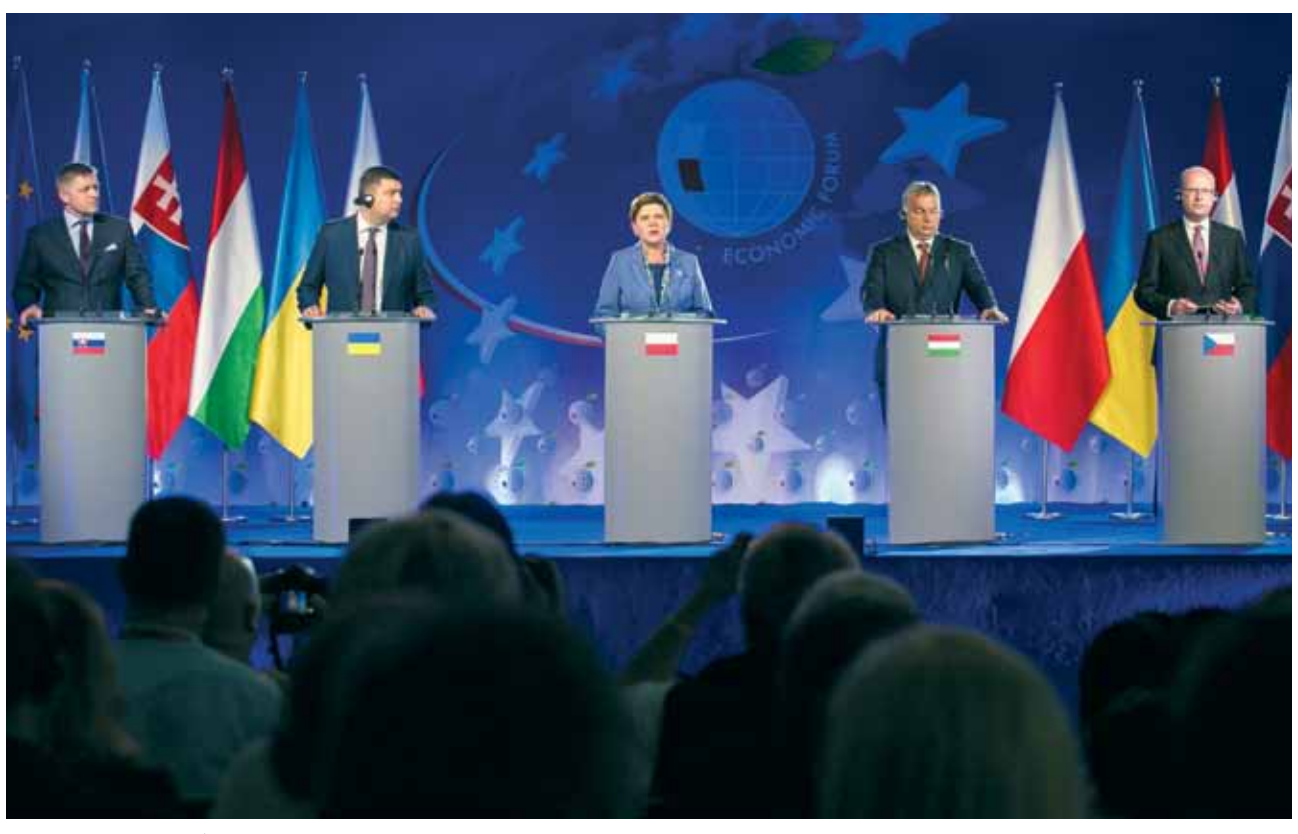
26th Economic Forum (2016): Robert Fico , Prime Minister of Slovakia; Volodymyr Groysman , Prime Minister of Ukraine; Beata Szydlo , Prime Minister of Poland; Viktor Orban , Prime Minister of Hungary; Bohuslav Sobotka , Prime Minister of the Czech Republic