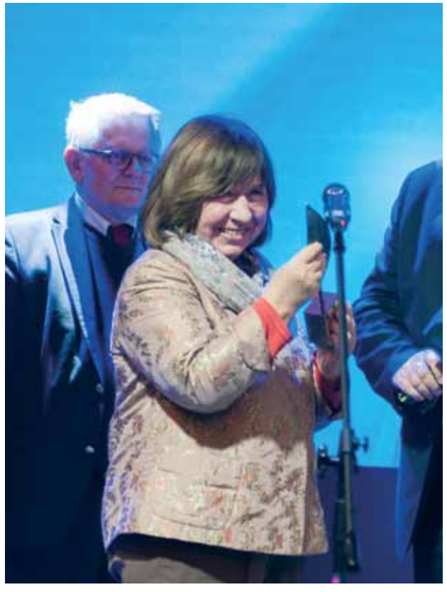
Svetlana Alexievich , Writer, Laureate of the New Culture of New Europe Awards