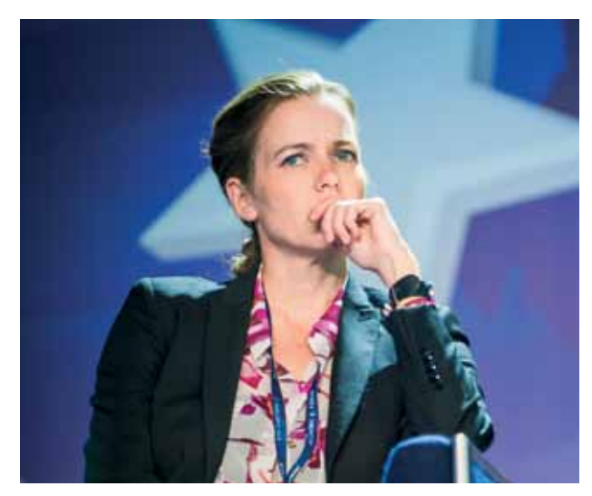
Ellen Trane Norby, Minister of Health and Prevention, Denmark