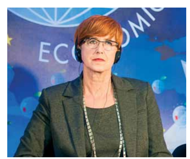
Elzbieta Rafalska, Minister of Family, Labour and Social Policy, Poland

During the Forum, leaders of tomorrow from all over Europe tighten their contacts, meet prominent politicians, scientists and businessmen to discuss the future of the continent and create ideas that change the lives of new generations. The programme includes discussion panels, lectures, business presentations and thematic workshops. During this year's edition of the event, representatives of NGOs, social, economic, student, political youth, employers' associations as well as young researchers, journalists and entrepreneurs paid particular attention to issues such as: leadership and challenges for the modern leader, vision and ideas for reform of the European