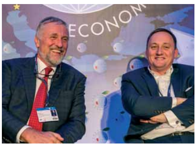
Mirek Topolanek, former Prime Minister, Member of the Board of Directors, Eustream, Czech Republic; Martins Kazaks, Council Member, The Fiscal Discipline Council. Latvia

– As a result, we are convinced that it is well worth-while to seek the subjectivity of the whole region – and I mean our part of Europe - to strengthen its importance in European politics, but also to strengthen sovereignty of our states. So that the interests of the states are not ignored at the international forum – emphasized the Speaker. He added, that an example of the effectiveness of such activities is the project of the ViaCarpatia road.