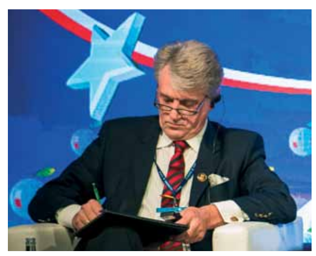
Viktor Yushchenko, former President, Ukraine

country, but pay their taxes in another. The other 'pathology' mentioned by Morawiecki , was the 'VAT mafias'. Every year, Europe loses circa EUR 200 billion due to their criminal activities. Polish Deputy Prime Minister said that the European Union should put greater emphasis on strengthening its tax system.