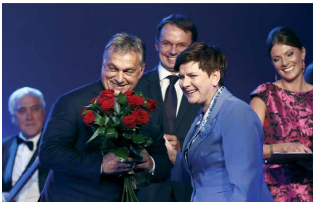
Viktor Orban, Prime Minister of Hungary and Beata Szydło, Prime Minister of Poland