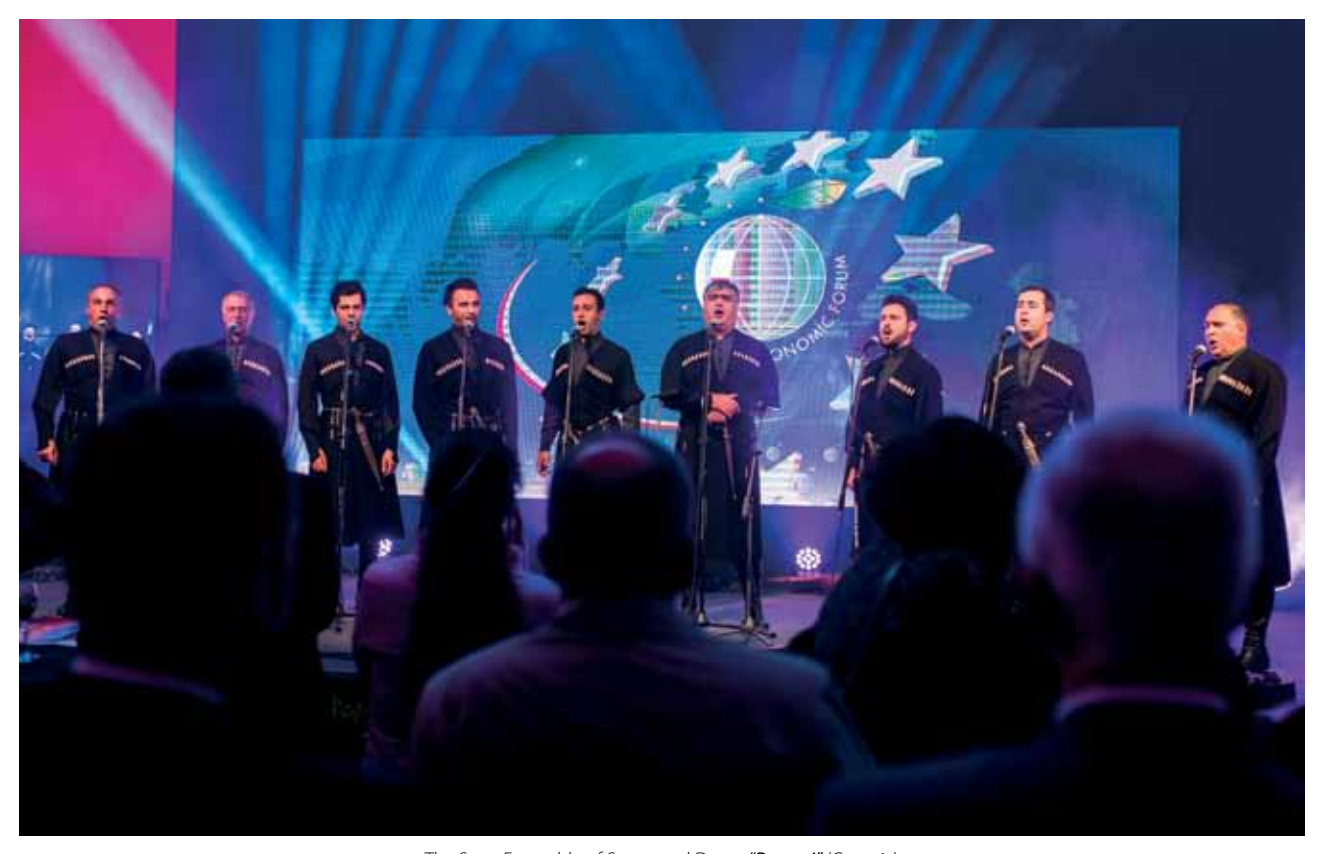
The State Ensemble of Songs and Dance "Rustavi" (Georgia)