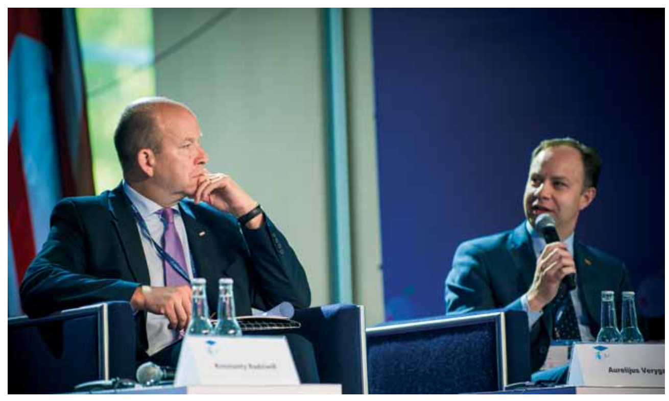
Plenary Session: "Health and Economic Development": Konstanty Radziwill, Minister of Health, Poland; Aurelijus Veryga, Minister of Health, Lithuania