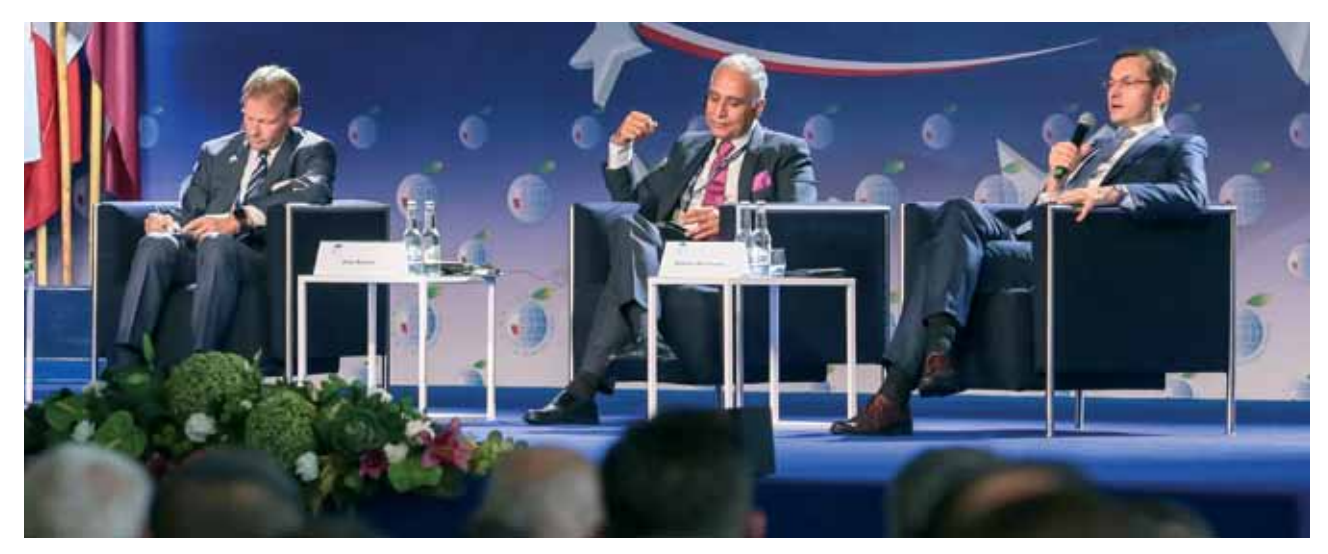
Plenary Session "Growth Recovery Plan for Europe": Vazil Hudak, Vice-President, European Investment Bank, Slovakia; Arup Banerji, Regional Director for the European Union Countries, Europe and Central Asia, The World Bank, India; Mateusz Morawiecki, Deputy Prime Minister of Poland, Minister of Development and Finance, Poland

(India), Vazil Hudak, Vice-President of the European Investment Bank (Slovakia) also participated in the Forum's debates.