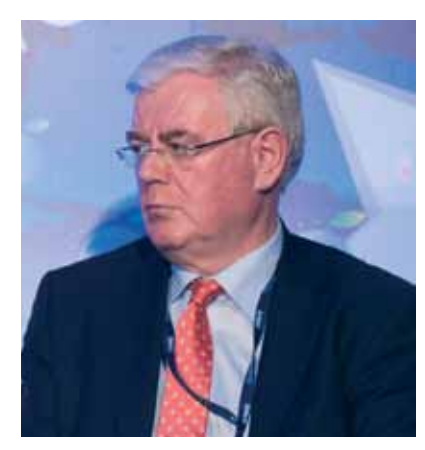
Eamon Gilmore , former Deputy Prime Minister and Minister for Foreign Affairs, Houses of the Oireachtas, Ireland